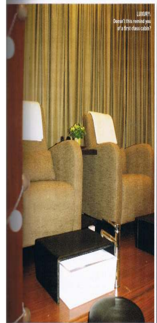
LUXURY: Doesn't this remind you of a first class cabin?