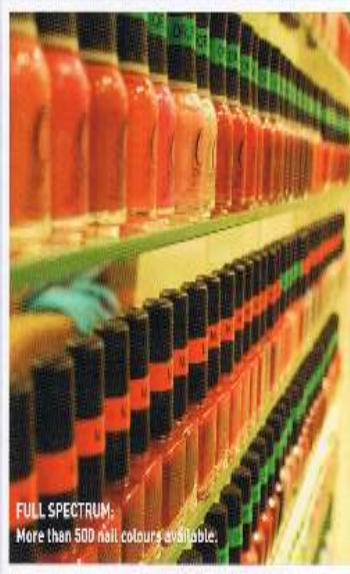
FULL SPECTRUM: More than 500 nail colours available.