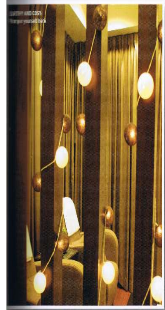
COMFORT AND COSY: Recharge yourself here

HOW Make your way to 30 East Coast Road, Ross Square 1 and cross the overhead bridge which leads to Ross Square 1.