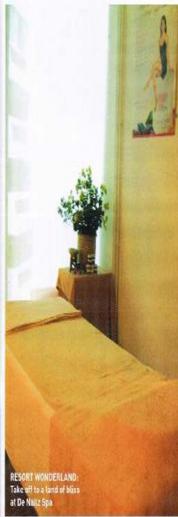
RESORT WONDERLAND: Take off to a land of bliss at De Nails Spa